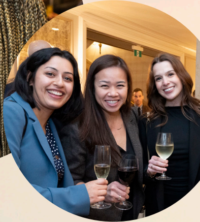
Table Sponsor Champions of Journalism $10,500