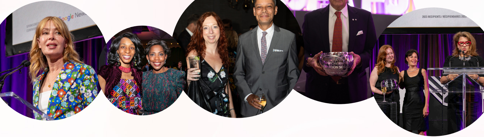
Table Sponsor – Champions of Journalism $10,500